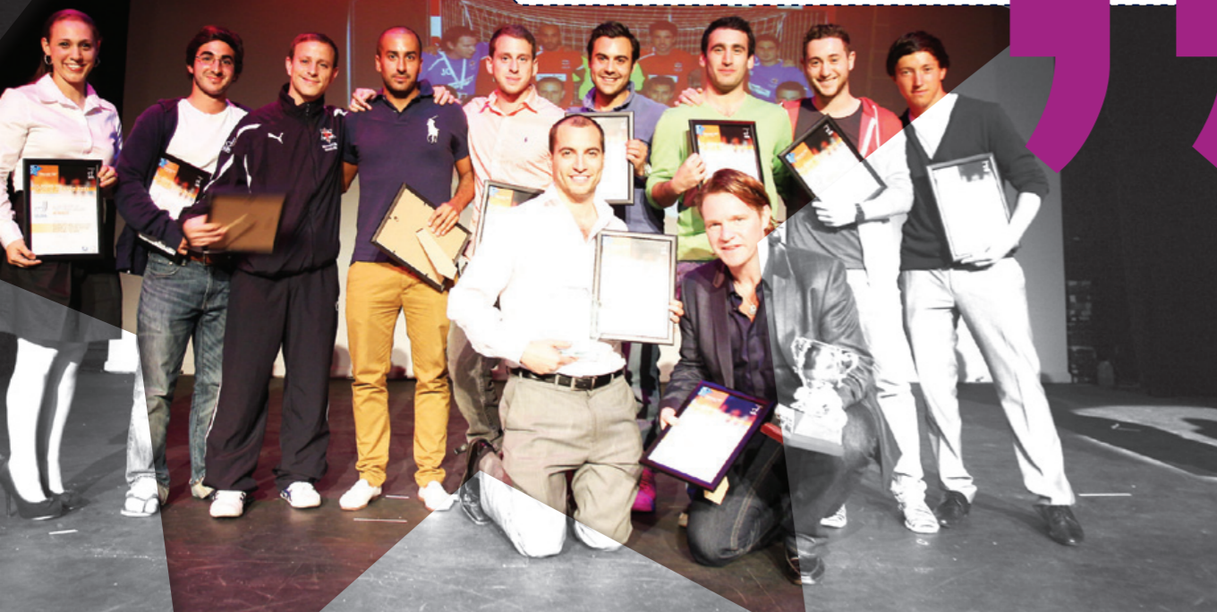
Maccabi GB European Maccabi Games Open Futsal Squad

To be here among so many talented people made me feel so proud. It's brilliant being here, let alone winning. As someone who lives outside of London and does not have local access to a local Maccabi Community this has been an amazing evening - I feel so at home here.